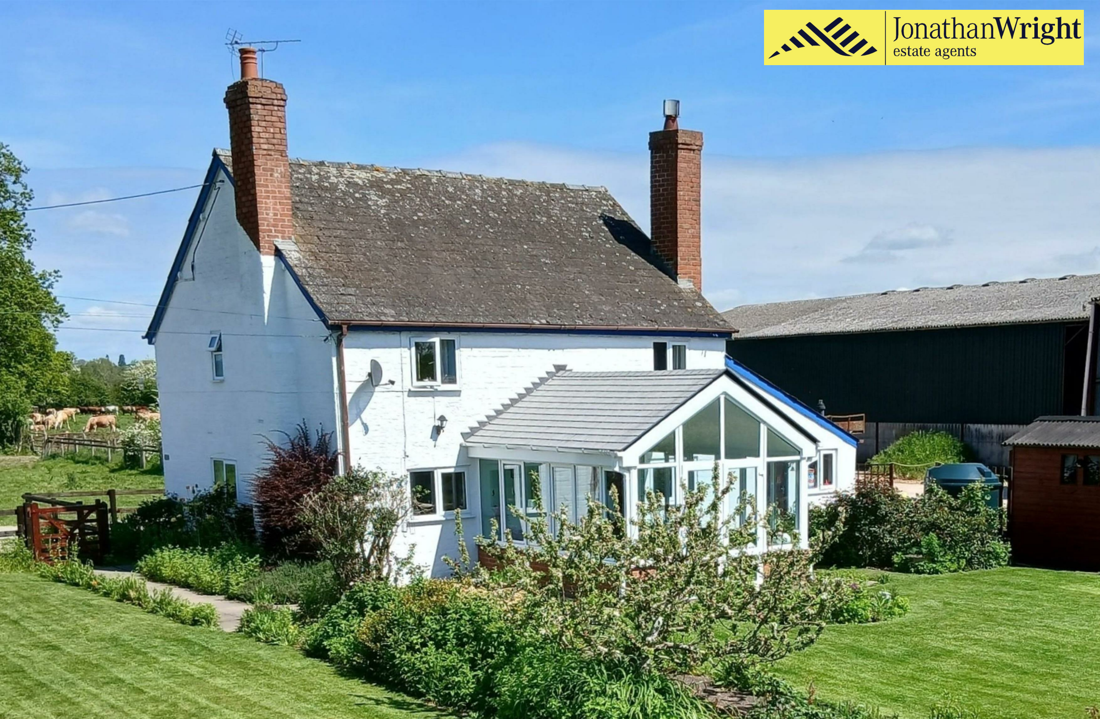
Pinsley Park , Cholstrey, Nr Leominster HR6 9AP. No Onward Chain £470,000